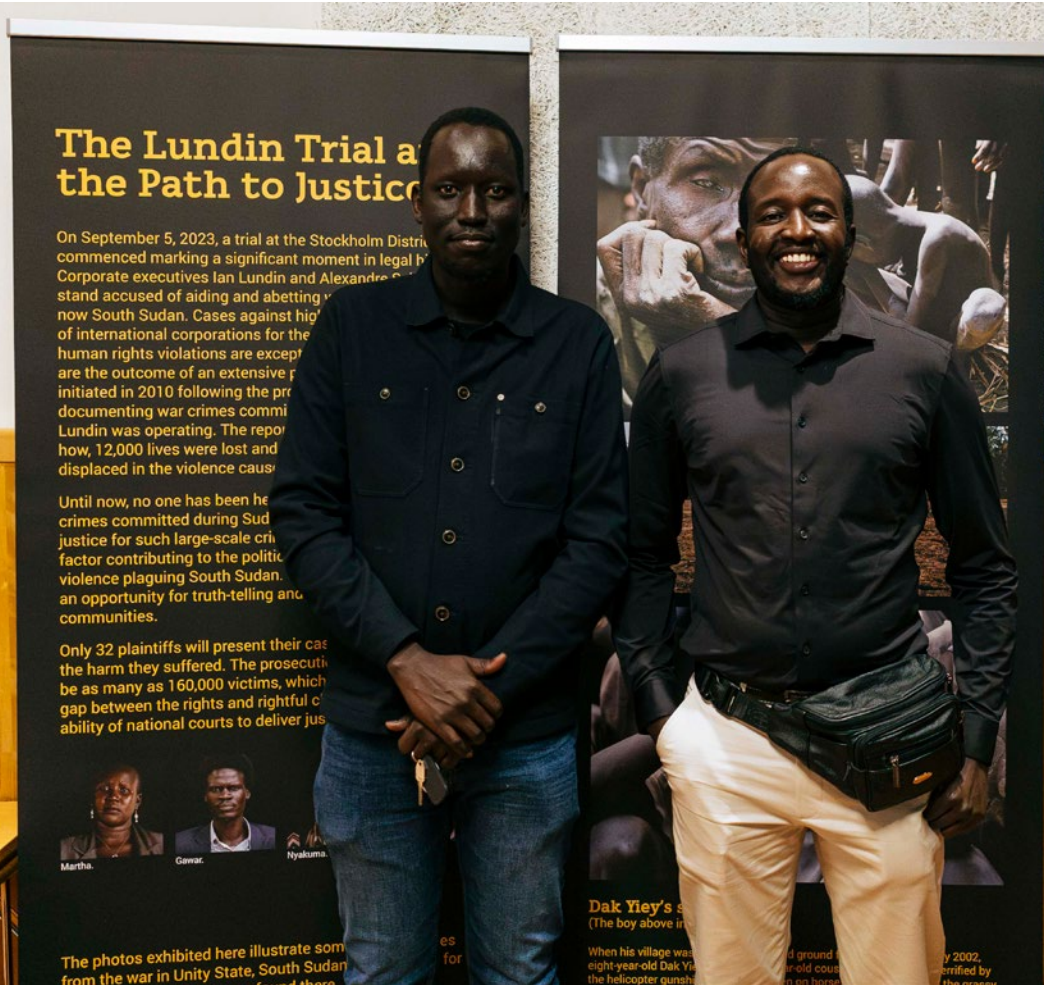
Plaintiffs from the Lundin Oil trial.