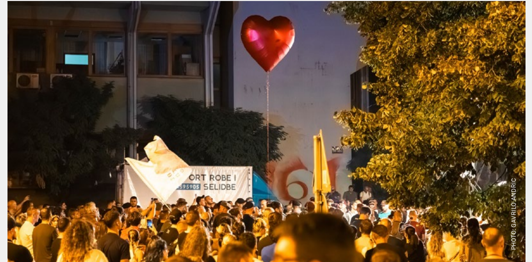
One year after the Novi Sad train station canopy collapse, people gathered across Serbia. What began in silence grew into marches from city to city.

the strategic period and develops an action plan for each focus area, detailing the current state to the desired state. Progress within the focus areas is monitored and evaluated quarterly. When the goals within a focus area are completed, it is concluded, and if necessary, new focus areas are developed in accordance with the strategy.