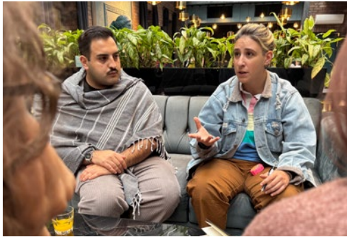
Discussions about personal security taking place in Chisinau.