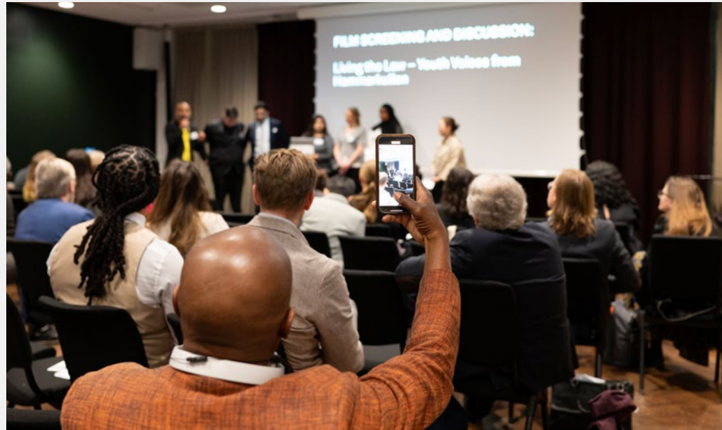
The Nordic Rule of Law Forum in December brought lawyers, judges, researchers, and civil society together to discuss changes in migration law in Sweden.

In December, Civil Rights Defenders organised the Nordic Rule of Law Forum for the fifth consecutive year, this time in cooperation with the University of Gothenburg. The forum aims to strengthen respect for human rights and the rule of law, and to increase interest in and