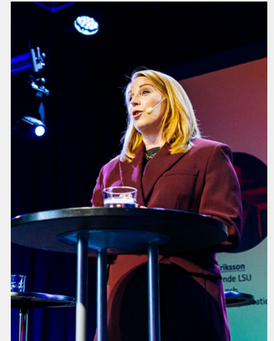
On the International Day of Democracy, 15 September, Civil Rights Defenders together with Oxfam Sverige, LSU, Fremia, LO and TCO held a democracy conference in Stockholm. In the photo: Annie Lööf, former party leader of Centerpartiet.

Guided by the principle of equal dignity for all, Civil Rights Defenders works toward a world of democratic societies in which we all enjoy our civil and political rights. Conflicts and human rights violations increasingly pervade our world, and a well-functioning, strong, and local civil society is becoming increasingly important. Civil Rights Defenders endeavours to bring about progress in politics, business, and civil society by working and developing together on the important issues of human rights. We believe that our engagement and expertise within our areas of knowledge help to bring about change and a better world for all.