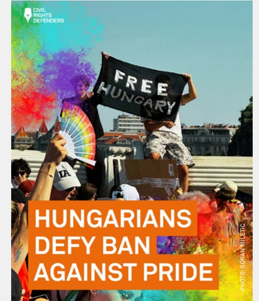
On 15 June, the Hungarian parliament passed a law criminalising public depictions of and discussions about LGBTI+ issues. The day before, large crowds protested outside parliament.