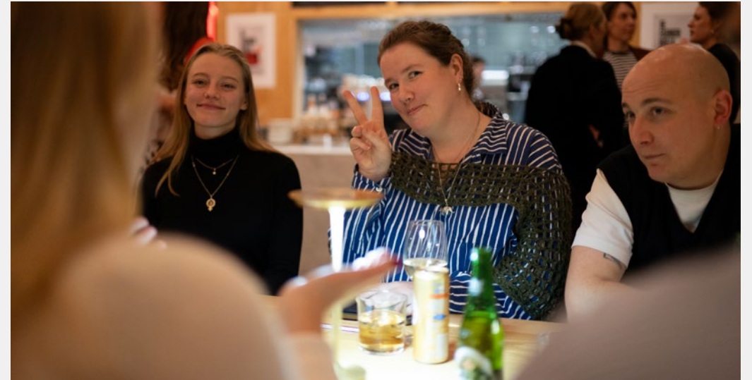
In November, we brought civil society together for a game night to mark the launch of our board game Käften! – the free speech battle.

In Sweden, Civil Rights Defenders launched the campaign Det finns bättre sätt att skydda barn (Eng: There Are Better Ways to Protect Children ) as part of its efforts to strengthen