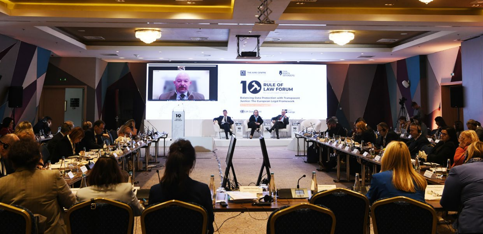
The Rule of Law Forum, organised by Civil Rights Defenders in cooperation with the AIRE Centre.]