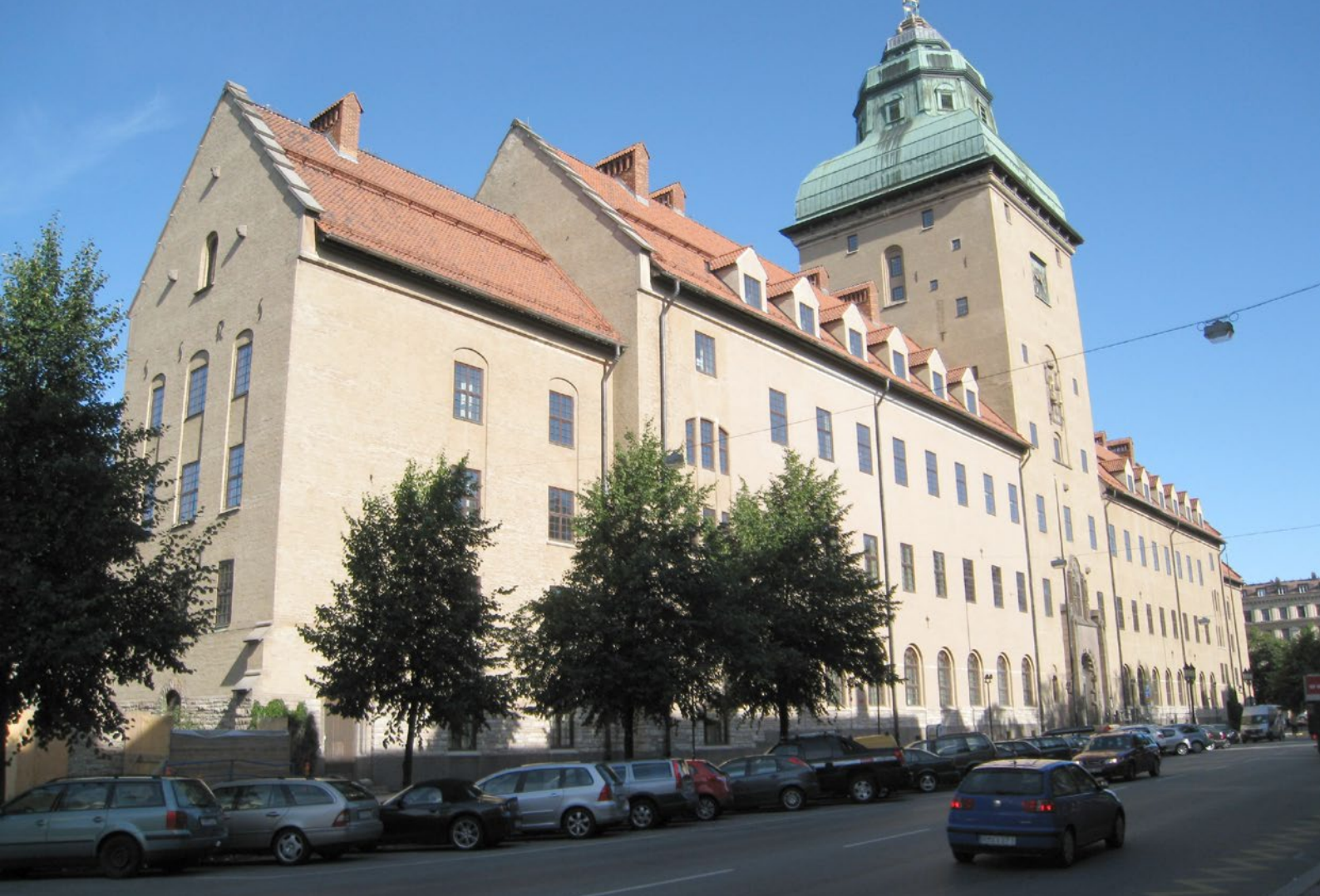
Stockholm District Court.