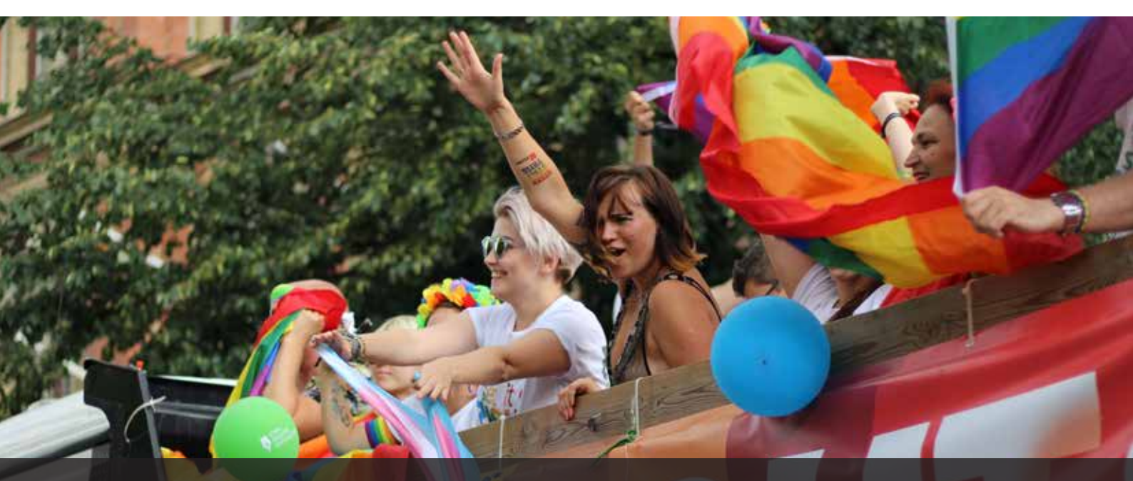
Forty of Civil Rights Defenders' partners from Russia, Belarus, Albania, Bosnia and Herzegovina, Macedonia, Montenegro, Kosovo, Serbia, and Turkey participated in Europride in Stockholm. Because of their work for LGBTI+ rights, many live under constant threat and are persecuted in their home countries.

In Turkey, the situation for civil society has deteriorated. The people who nevertheless continue to work to ensure respect for human rights are monitored and subjected to threats, harassment and smear campaigns, or are imprisoned for their work. One example is the prominent human rights defender Osman Kavala, who has been imprisoned without trial for over a year. Civil Rights Defenders has been present on-site, offering support to human rights organisations and helping to create networks for local human rights defenders.