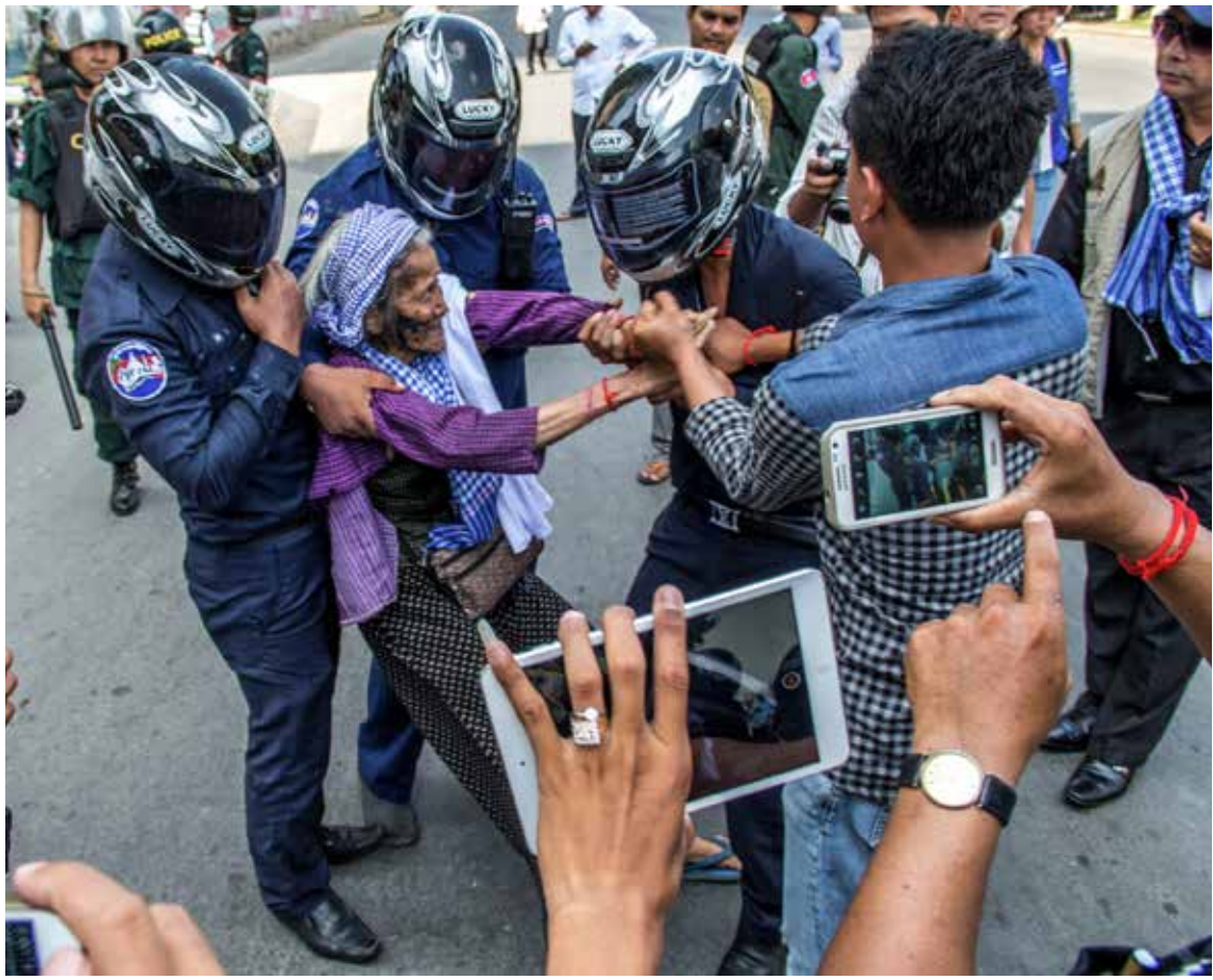
Civil Rights Defenders continues to fight for greater protection for human rights defenders at risk.